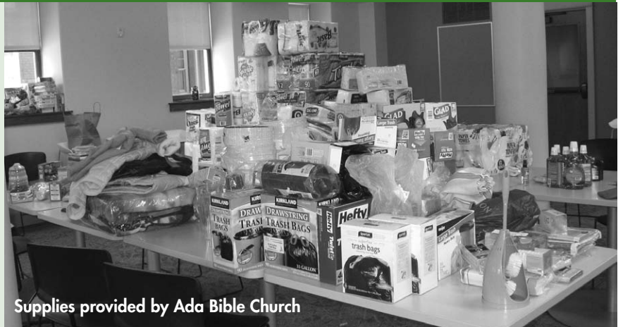
Supplies provided by Ada Bible Church

One could get a genie complex at ICCF. You know that line, "Your wish is my command"? We submit a wish list of supplies to Ada Bible Church, and they make quarterly deliveries of large quantities of cleaning supplies and hygiene supplies to ICCF. The supplies are used by our maintenance staff, by our volunteers, and by our residents at Family Haven. The church's generosity lightens our workload and saves us money. Prior to its distribution, a recent delivery filled the tables and lined the walls in our staff Commons (see photo). We are very grateful for this faithful form of support.